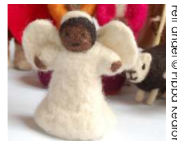
Felted sheep

The Ha Nyenye Craft Group, an Action Lesotho supported women's craft co-operative that specialises in making quilts from clothes factory scraps and felted sheep-wool figures, received their first major international order recently. See page 2 for more details.