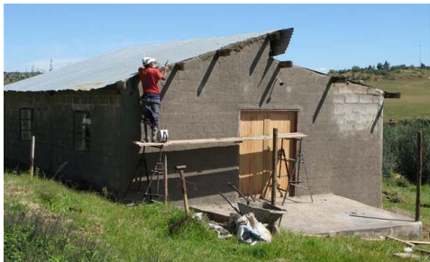
New mill building

Action Lesotho's farm & mill project is progressing well, with the new mill building at a stage where it's nearly ready to deal with this year's crop. The mill was formerly on private land, but has now been relocated