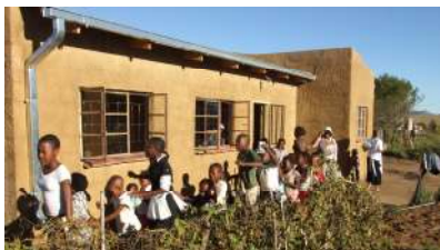
Loant'sang

❖ Feeding programme: the Loant'sang committee continues to feed up to 100 orphans & vulnerable children on the weekend feeding programmes. In Lesotho, the weather is turning cold as the season heads towards winter, so they are particularly concerned about making sure the children stay warm and well fed. They are putting hot tea on the menu instead of juice for the winter months!