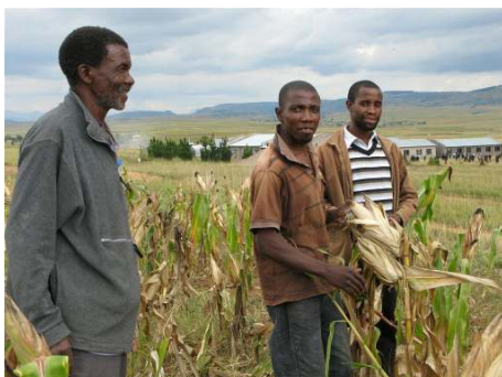
Farm inspection