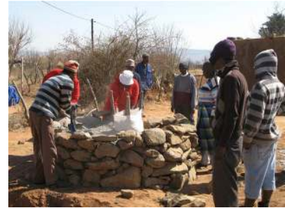
Photo: Ha Chonapase pig project committee constructing a keyhole garden